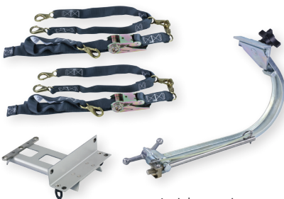
Aerial mounting system